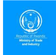
Ministry of Trade and Industry